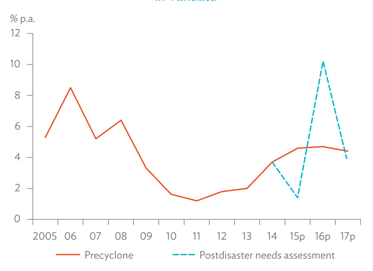
Figure 1: Impact of Cyclone Pam on projected GDP growth in Vanuatu

GDP = gross domestic product, p = projection.